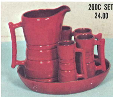
26DC SET 24.00