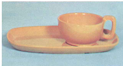
SOUP AND SANDWICH SET 4SC—11 OZ. SOUP CUP 3.75 6P—11" PLATTER-TRAY 4.50