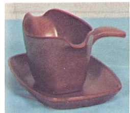
6S—TWO-SPOUT GRAVY 6.50 5PS—9" PLATTER-TRAY 3.75 6S/ST—TWO-SPOUT GRAVY/W TRAY 10.00