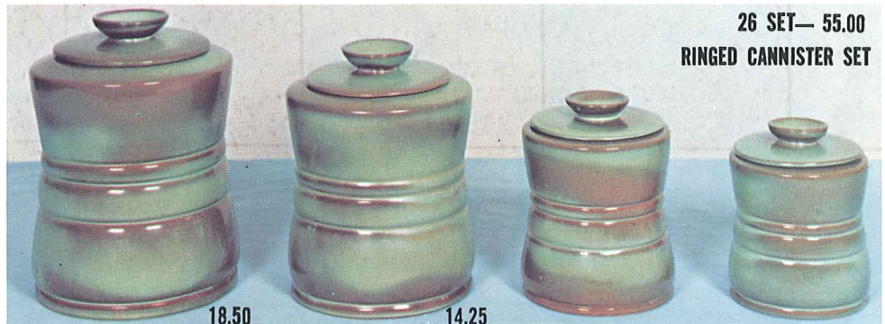
82 SET— 55.00 RINGED CANNISTER SET