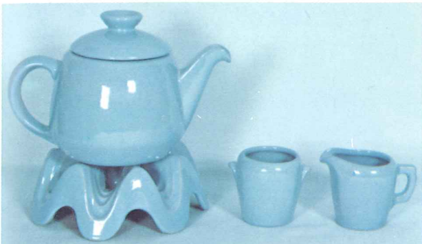
6T—6 CUP TEAPOT 9.25 5DA—6 OZ. CREAMER 3.25 WA3—6" WARMER W/CANDLE 5.00 5DB—6 OZ. SUGAR 3.25