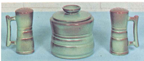
26G—SUGAR/GREASE 26H—SALT & PEPPER 9.25 26GH—4-PIECE SET/BOXED 6.00 15.00