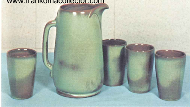
9.25 80—2 QT. PITCHER 5L—12 OZ. TUMBLER 3.75