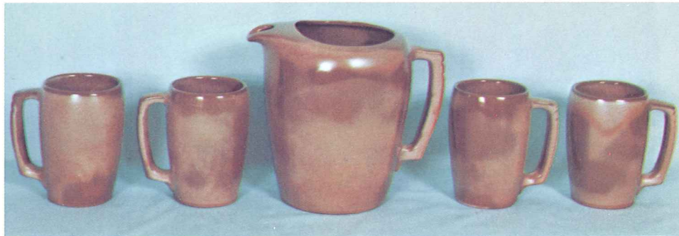
12.50 5D—3 QT. PITCHER 5M—16 OZ. MUG 4.50