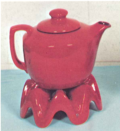
5TL/W—TEAPOT & WARMER SET 20.00 5TL—12-CUP TEAPOT WA1—WARMER 13.00 7.50