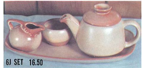
6J SET 16.50